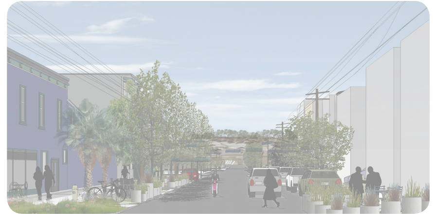
View of Traffic Calming at 22nd and Tennessee